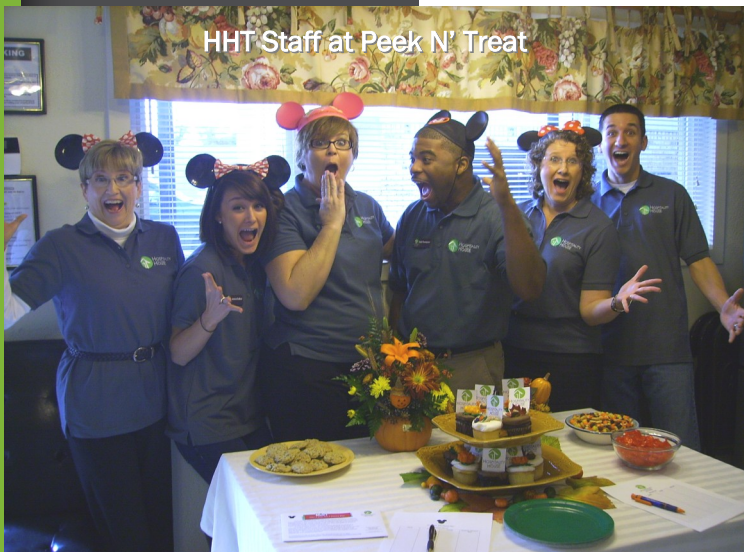
HHT Staff at Peek N' Treat

The program begins January 1, 2010 and continues until tickets are distributed or December 15, 2010, whichever occurs first. The first one million people to sign up with a participating organization and complete a day of volunteering will receive a free Disney day. YOU have the opportunity to be part of the first one million by signing up with Hospitality House beginning Jan. 1. We encourage interested volunteers to come by The Hospitality House and schedule their 2010 volunteer activities today!