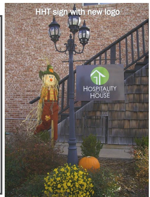
HHT sign with new logo