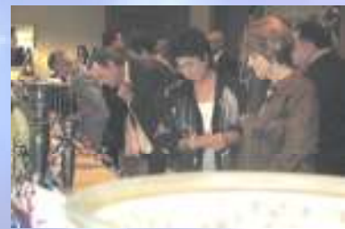
Hospitality House supporters gather around the silent auction tables